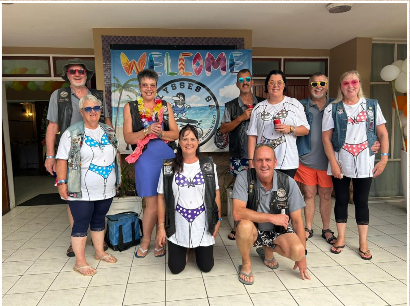
The West Wits Members at the 2023 National Convention.