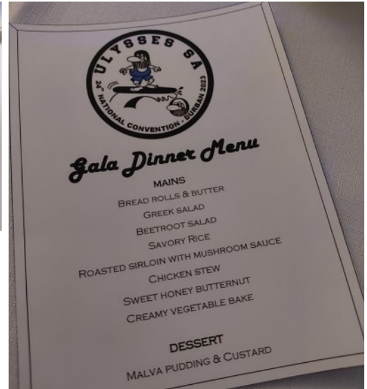
The Gala Dinner: Main Course & Desert